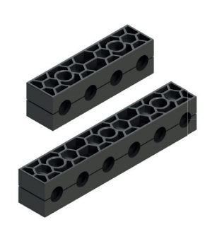
1. RSB®-Multiclamp With only 3 clamp sizes cover tube diameters from 6-25.4 mm.