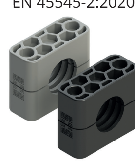
3. Flame retardant tube clamps The well-known line of RSB® tube clamps, available as a flame retardant version, is the ideal solution for the transport and railway market.