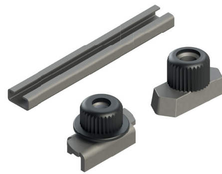
2. Mounting rails & mounting rail nuts Stainless steel mounting rails in different heights acc. to DIN 3015. Installation with mounting rail nuts. Optimized installation solution by FKB: VISITEC rail nut with loss protection.