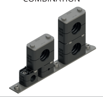
4. RSB®-'2+5-System' Two clamp sizes cover pipe diameters from 6-42 mm. Only one multiple weld plate with uniform bolt spacing for all tube clamps of the sizes 2+5.